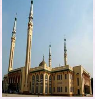
Conakry Grand Mosque