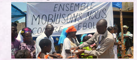
Social mobilizer dispenses antimicrobial spray foam in an effort to teach methods to prevent transmission of Ebola.